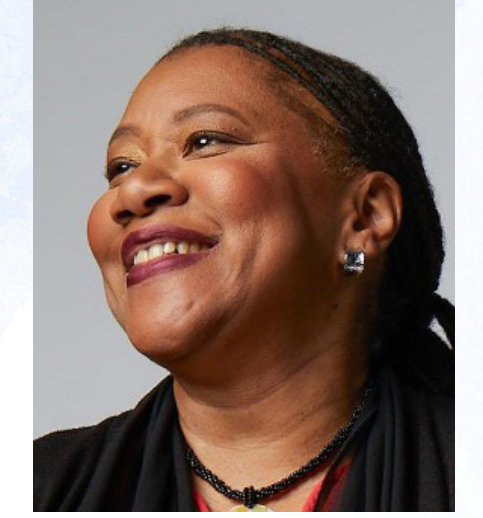
Emmy Award-Winning Journalist Georgia Democratic State and Host of "Closer Look" – Atlanta NPR station 90.1 FM -WABE