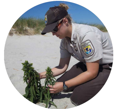
USFWS staff planting Seaside Goldenrod to improve Roseate Tern habitat

A backlog of 200 Comprehensive Conservation Plans (CCP) has also strained the System as funding for planning has largely been eliminated due to budget cuts. Planning is at the core of Refuge System management, but more than 40% of refuges have an outdated CCP or no plan at all. Increased funding for planning and management staff will allow the US Fish and Wildlife Service to begin to address this backlog and provide more of the tools it needs for active water management, habitat management and restoration, and invasive species eradication.