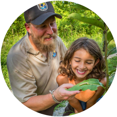
USFWS staff shows a young visitor a Monarch caterpillar on a leaf

Despite only minor increases in funding for the last 13 years, the Refuge System has added 14 new refuge units and hundreds of millions of acres of marine national monuments. It has also added new services, such as the Urban Wildlife Conservation Program launched in 2012 that seeks to address inequalities in recreational access and conservation participation. This program has dramatically changed the way conservation is delivered to communities, and visitor numbers have grown to over 67 million visitors a year in FY2022--an increase of 34% since FY2010. While the additional acreage, the creation of the urban program, and the increased visitors have enhanced the Refuge System and benefited the communities around these refuges, this growth has also put more pressure on the already stressed and underfunded System.