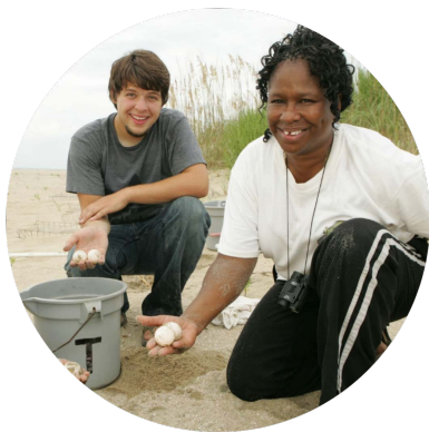
Volunteers relocating loggerhead turtle eggs to a site less vulnerable to ocean changes